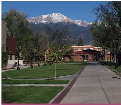
View from CC Campus

will also have access to the Adam Press Fitness Center and Schlessman Natatorium in our El Pomar Sports Center. Summer hours will be updated on the CC website .