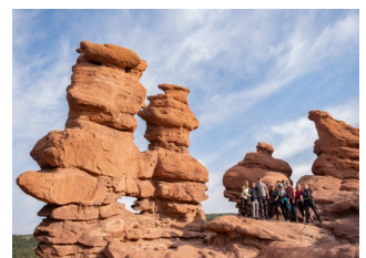
Garden of the Gods

appropriate attire for hiking if you plan to participate in these events (athletic shoes or light hiking boots are suggested; sandals not recommended).