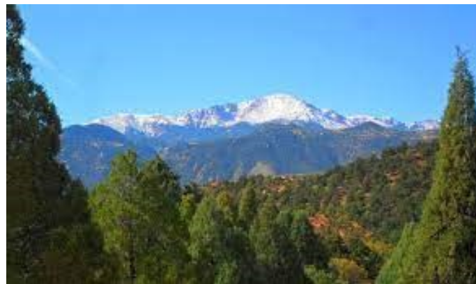
Pikes Peak; 14,111 feet

Colorado Springs is close to the mountains so the weather can change at a moment's notice. Summer can become quite warm, but remember to pack an umbrella and or rain jacket as afternoon summer storms are common. You'll probably need a light jacket or sweater for cool summer nights. We are considered high mountain desert, so the humidity is usually quite low compared to other regions of the U.S., causing temps to drop significantly at night.