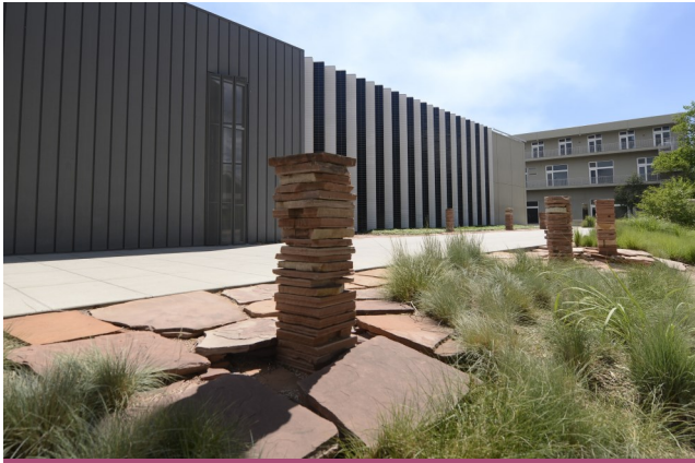
Packard Music Hall

The E.K. Gaylord Cornerstone Arts Center houses the Celeste Theatre where all the Festival Orchestra and Children’s Orchestra concerts will take place. The Flex Room is also in Cornerstone and is used for many rehearsals. The Main Space will host the annual donor dinner and the celebration following the June 13 Festival Orchestra concert.