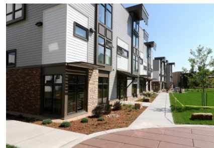
East Campus Apartments

In order to maintain privacy, our cleaning staff cannot enter your living space, so please tidy up after yourselves. You will need to empty your room and communal trash. More information about this will be in your welcome packet.